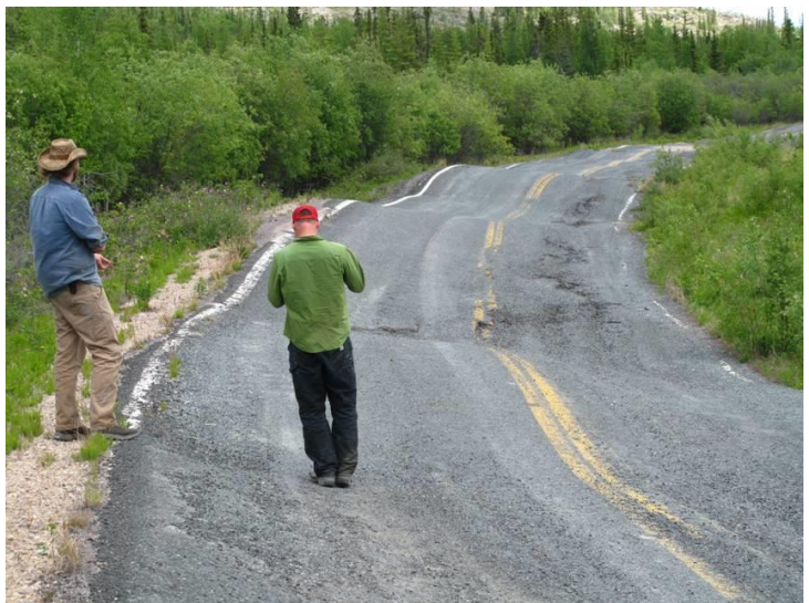
Thawing permafrost damaged this section of Highway 4, east of Yellowknife in Canada's Northwest Territories.

The Arctic Monitoring and Assessment Programme's Snow, Water, Ice and Permafrost in the Arctic (SWIPA) assessment focuses on changes to the Arctic cryosphere (the portion of the Arctic land and water that is seasonally or perennially frozen), and the implications of those changes. The second SWIPA assessment, which covers the period 2011–2015, with some updates to include observations from 2016 and early 2017, was published in 2017. This fact sheet reports on 2017's findings related to recent observed changes in the Arctic. For more information, see the chapters referenced in the fact sheet.